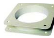
Shock Absorber Vehicle Mount